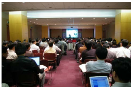
LED Korea 2007