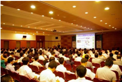
Mobile DesignCon 2009