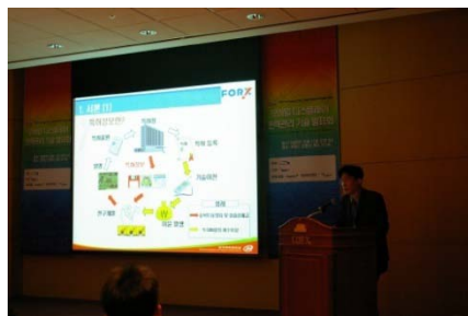
Mobile Display & Power Management Seminar 2005