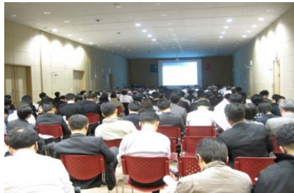
Mobile DesignCon 2008