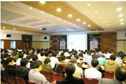
EMI/ESD Protection Seminar 2008