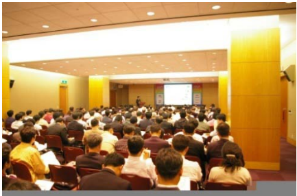
LED Korea 2008