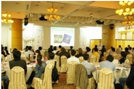
Mobile Video Summit 2007