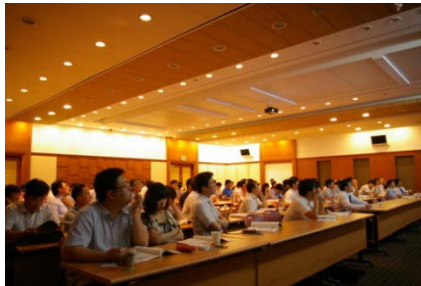
LED TV 2009