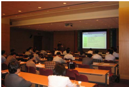
FPD for Korea 2005