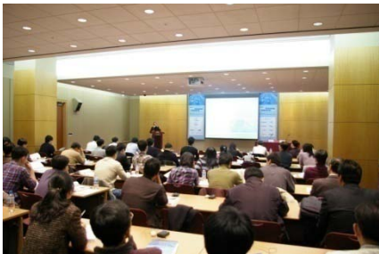
WPAN Technology Outlook for 2007