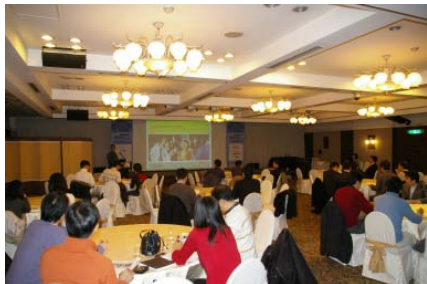
WPAN Technology Outlook for 2008