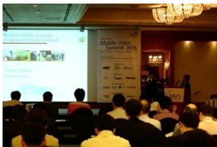
Mobile Video Summit 2006