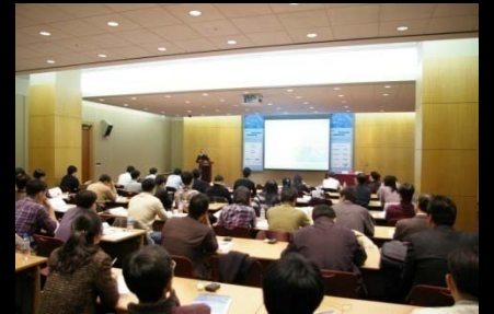
WPAN Technology Outlook for 2007