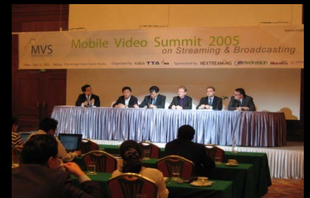
Mobile Video Summit 2005