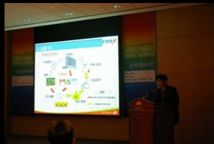
Mobile Display & Power Management Seminar 2006