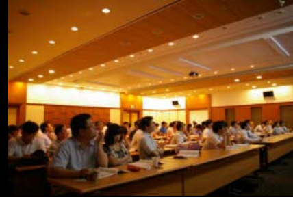
LED TV 2009