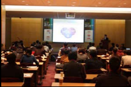
LED TV 2010