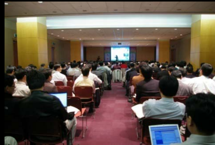
LED Korea 2007