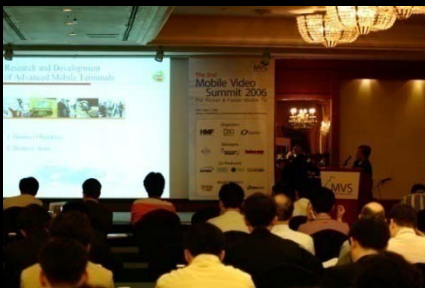
Mobile Video Summit 2006