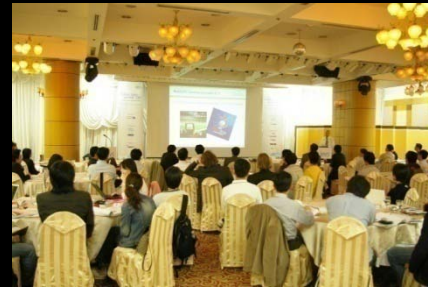
Mobile Video Summit 2007