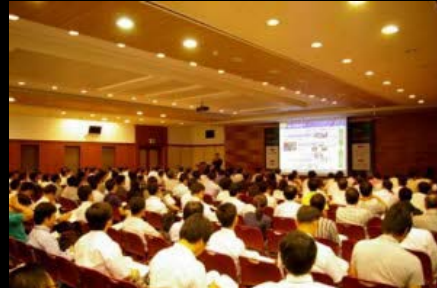
LED Korea 2009