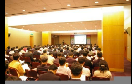
LED Korea 2008