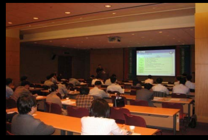
FPD for Korea 2005