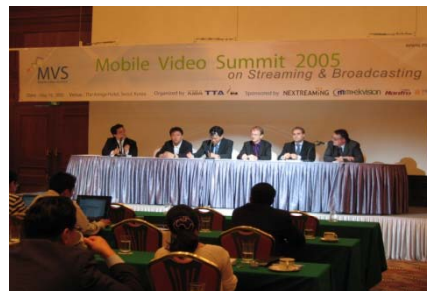
Mobile Video Summit 2005