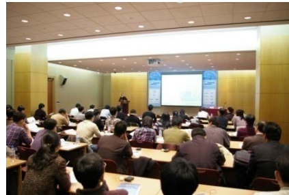
WPAN Technology Outlook for 2007