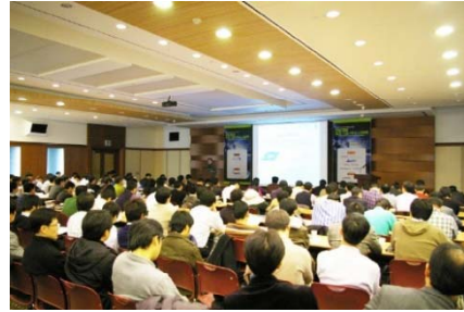
EMI/ESD Protection Seminar 2008