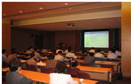
FPD for Korea 2005