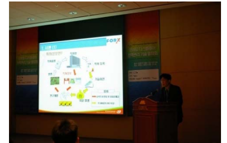
Mobile Display & Power Management Seminar 2006