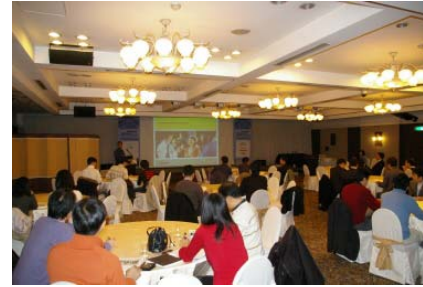
WPAN Technology Outlook for 2008