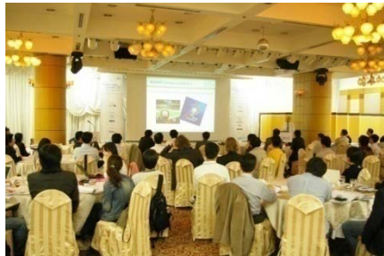
Mobile Video Summit 2007