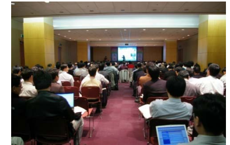
LED Korea 2007