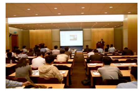
FPD for Korea 2004, Spring