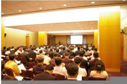
LED Korea 2008