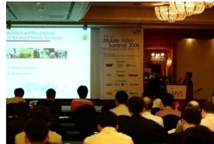
Mobile Video Summit 2006