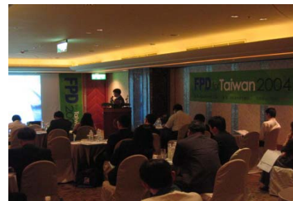
FPD for Taiwan 2004