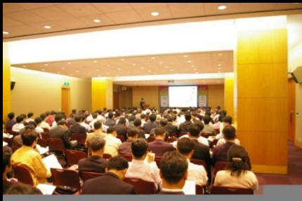
LED Korea 2008