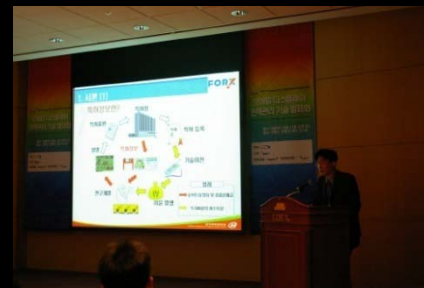
Mobile Display & Power Management Seminar 2006