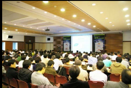
EMI/ESD Protection Seminar 2008