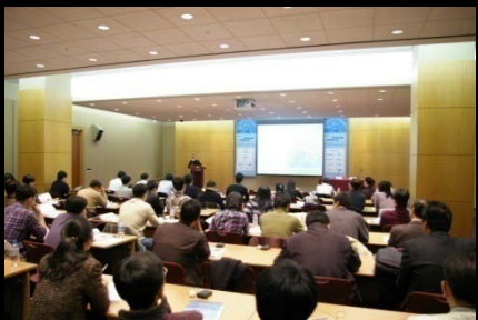
WPAN Technology Outlook for 2007