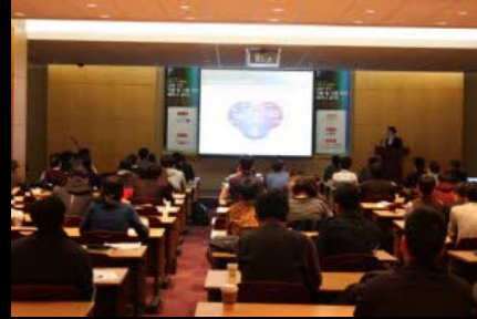
LED TV 2010