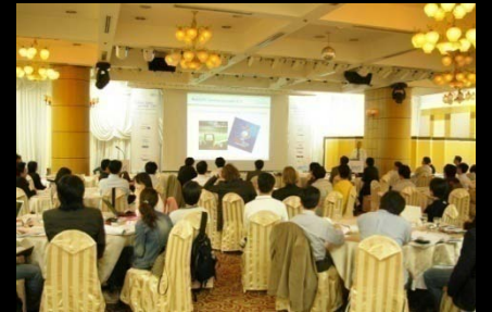
Mobile Video Summit 2007