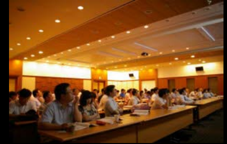
LED TV 2009