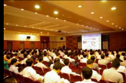
LED Korea 2009