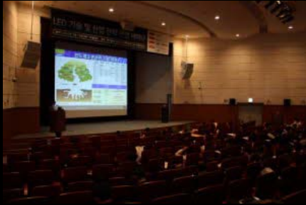
LED DesignCon Korea 2010