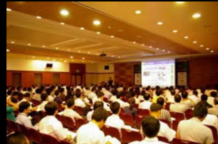
LED Korea 2009