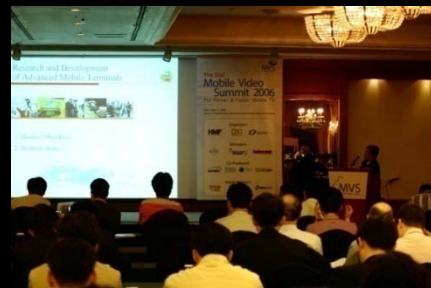
Mobile Video Summit 2006