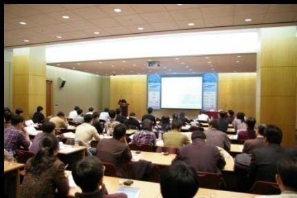
WPAN Technology Outlook for 2007