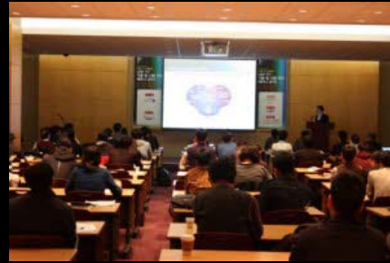
LED TV 2010