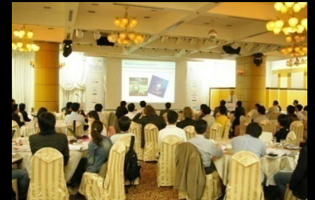
Mobile Video Summit 2007