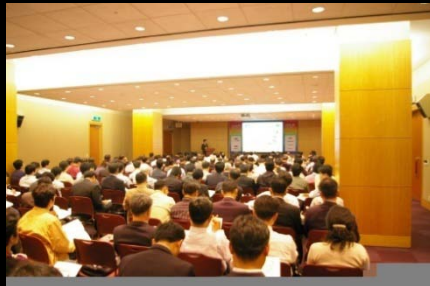
LED Korea 2008