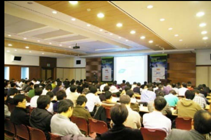
EMI/ESD Protection Seminar 2008