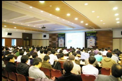
EMI/ESD Protection Seminar 2008