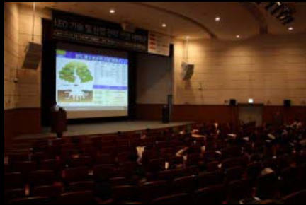
LED DesignCon Korea 2010