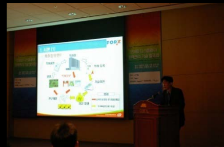
Mobile Display & Power Management Seminar 2006