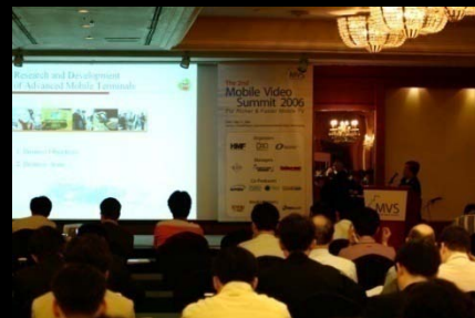
Mobile Video Summit 2006