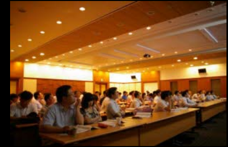
LED TV 2009