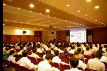
LED Korea 2009