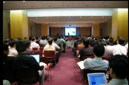
LED Korea 2007