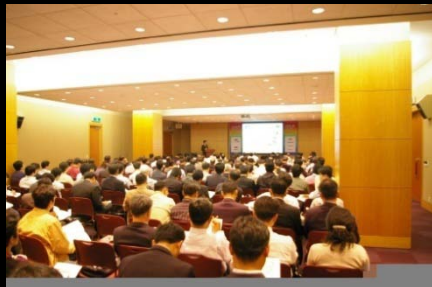
LED Korea 2008