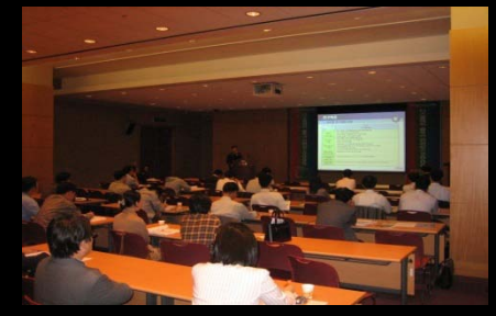
FPD for Korea 2005