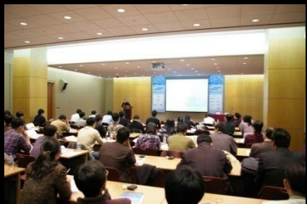
WPAN Technology Outlook for 2007